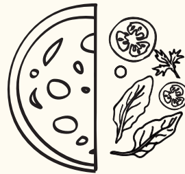
HALF PIZZA, HALF SALAD

*Each half and half pizza is charged at half the price of each of the whole pizzas