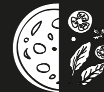
HALF PIZZA, HALF SALAD

*Each half and half pizza is charged at half the price of each of the whole pizzas