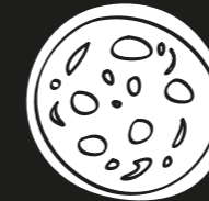
FULL 12" PIZZA