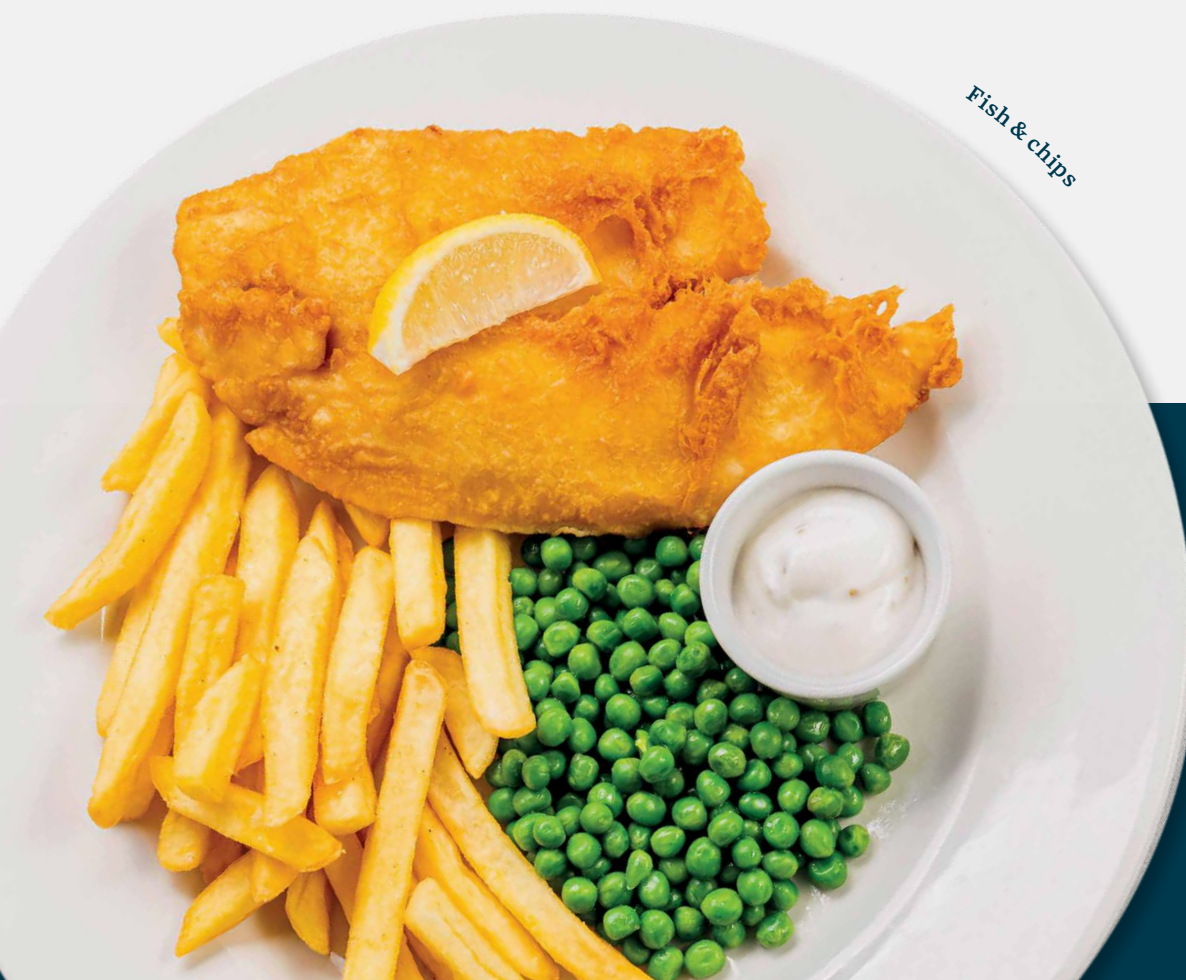
Fish & chips