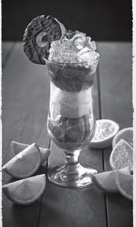
Alcohol (*) Bones (+) Vegi (V) Vegan (VE)