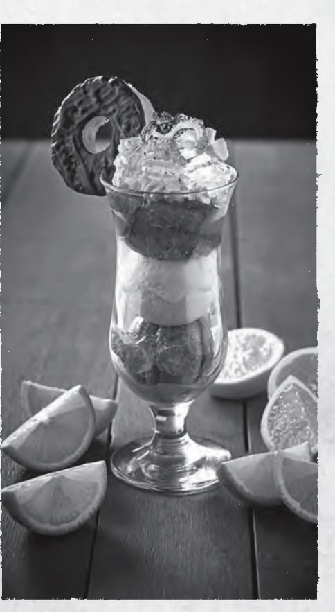
Alcohol (*) Bones (+) Vegi (V) Vegan (VE)

Ask at the bar for our range of Fruit Shoot & Fruit Shoot Hydro flavours. (Not included in the meal deal.)