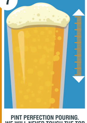
WE WILL NEVER TOUCH THE TOP TWO THIRDS OF YOUR GLASS